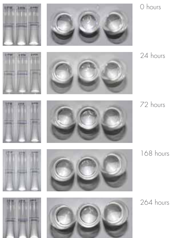
Figure 3: UV stability test (lightbox).

Shell Ondina 919: conventional medicinal white oil Viscosity at 40°C: 21.5 mm 2 /s Shell Ondina 941: conventional medicinal white oil Viscosity at 40°C: 95 mm 2 /s Shell Ondina X 430: GTL-based medicinal white oil Viscosity at 40°C: 44 mm 2 /s