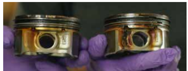
Piston on the left was from a gasoline engine using Shell ROTELLA® T6 Multi-Vehicle and the one on the right was from a gasoline engine using a leading passenger car motor oil. Both were torn down at about 100,000 miles.

In order for a diesel engine oil to meet API SN, Shell ROTELLA® T6 Multi-Vehicle 5W-30 is blended with lower levels of phosphorous so it doesn't damage catalyst systems in gasoline engines. Even still, Shell ROTELLA T6 Multi-Vehicle 5W-30 Full Synthetic has demonstrated excellent wear protection over millions of miles of testing in heavy duty diesel engines.